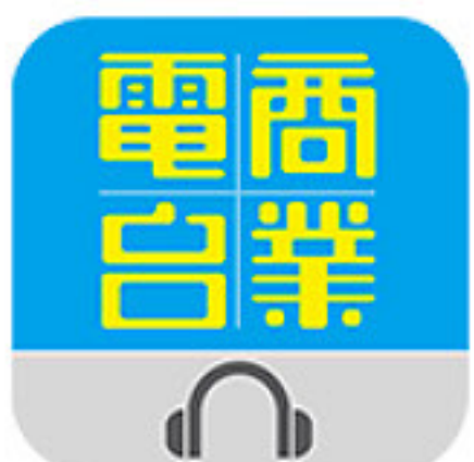
Hong Kong Toolbar