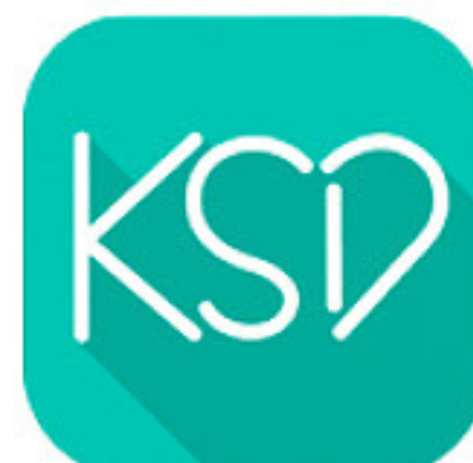
Korea Star Daily 韓星網